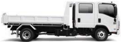
NPR 300 Tipper Crew