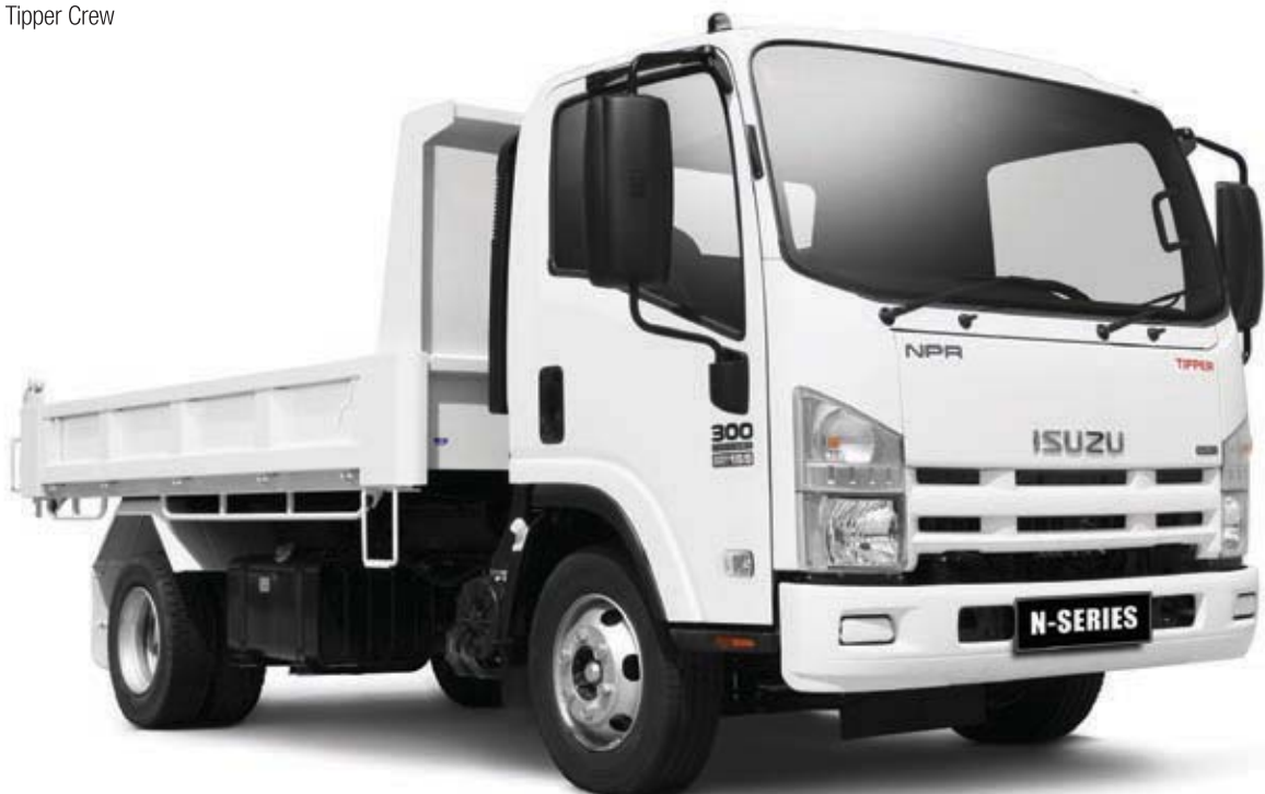
NPR 300 Tipper

AUSTRALIA'S TOP SELLING TRUCK BRAND SINCE 1989. Truck tracker 2007.